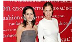
10 New Female Billionaires In 2014 (The Richest)