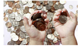
The 8 Least Expensive States to Live in the U.S. (Wall St. Cheat Sheet)